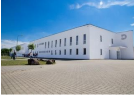
Satu Mare, Romania