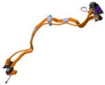
modular high-voltage charging system